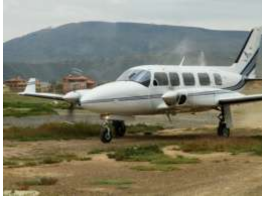
Figure 3. Our new twin-engine plane arrives at the hangar in Cochabamba

Our aviation fleet expanded in 2011, having received 2 twin-engine airplanes to complement the 2 single-engine Cessna planes that have been our mainstay since 2005. These new planes greatly increase our capacity by allowing us to make longer-distance flights (and fly faster), carry more people and cargo, and increase safety. In addition to getting new planes, Mano a Mano's core aviation program is to provide rural Bolivians air transport to receive emergency care in city hospitals. In 2011 we provided 321 emergency air rescues; many of these patients would have died without this service.