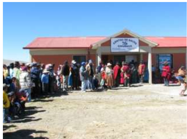
Figure 1. Dedication of clinic in Chunavi in May 2011