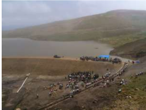
Figure 2. People gathered to dedicate the Sancayani reservoir